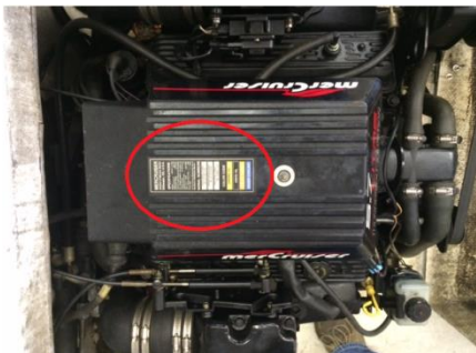
MOST MERCUISER ENGINE – Figure 3