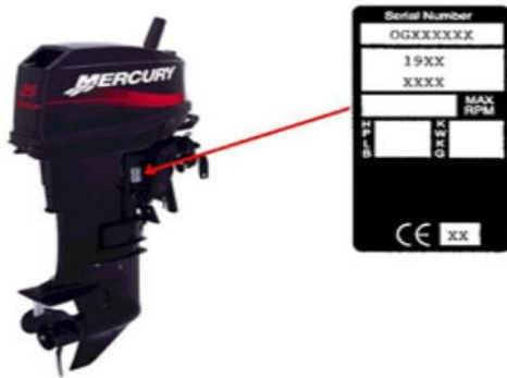
ON THE ENGINE – Figure 1